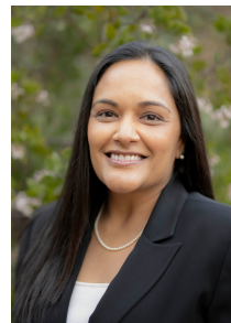
Honorable Kinna Crocker