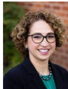
Honorable Paige Hein