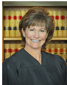
Honorable Shelly Averill